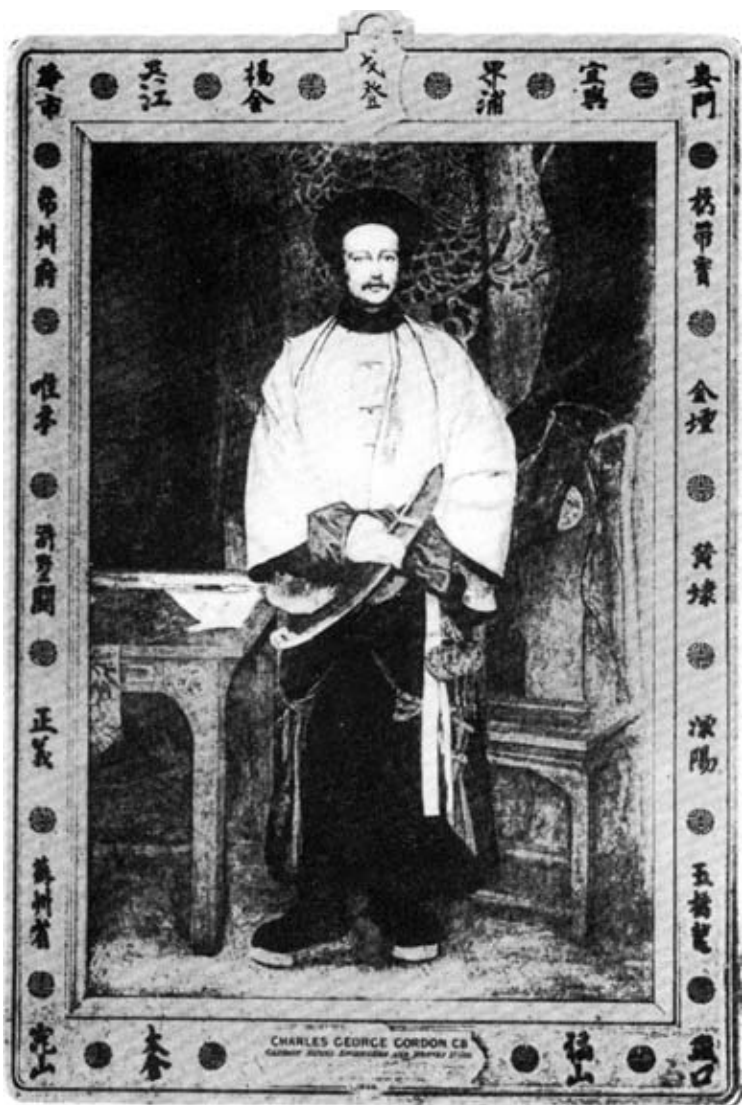
Charles George Gordon CB