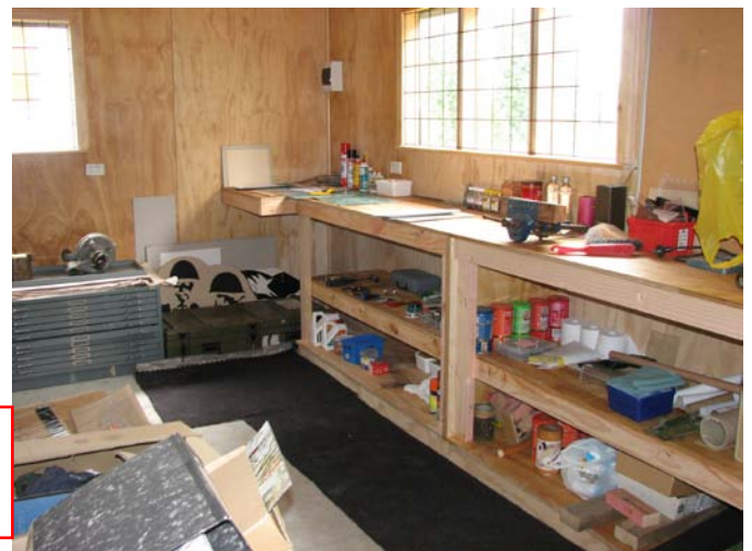
New curator's workshop in garage constructed by 2 Engr Regt & SME (NZ) tradesmen