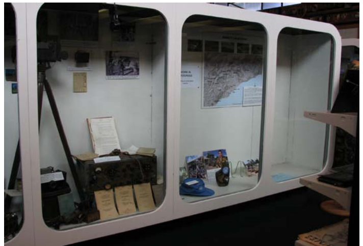
East Timor display awaiting contributions