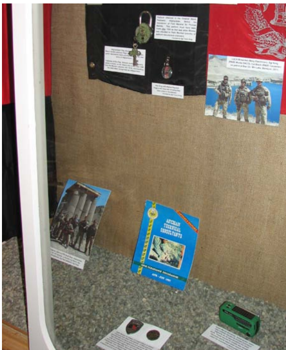
Afghanistan display awaiting contributions