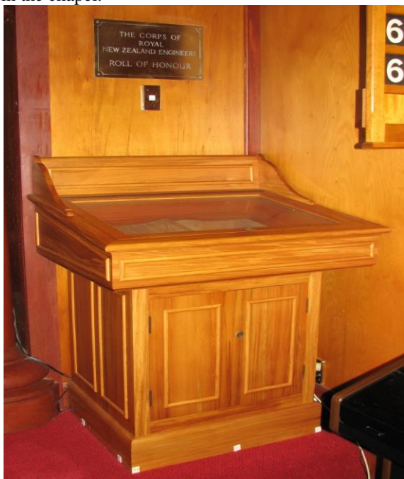
The cabinet containing the Rolls of Honour

Two of the most important functions sought for this chapel were a place recognised as a site for worship and a home for the New Zealand Engineers and Royal New Zealand Engineers Rolls of Honour. The Rolls of Honour of New Zealand Sappers killed in action during both World Wars are held in a special cabinet in the chapel.