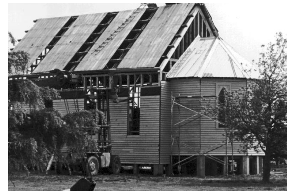
Chapel reconstruction progressing with parts fitting together like a jigsaw puzzle

Sgt Murray Holt was appointed task foreman and was responsible for rebuilding which included the replacement of all damaged or degraded timbers. Replacement of damaged timber took considerable time and skills of the sappers working on the re-construction were often tested.